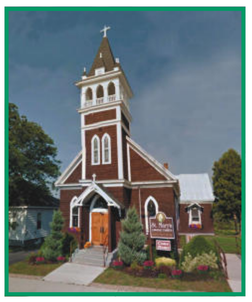
St. Mary's NYS Rt. 12, Copenhagen Land Deeded 1901, Incorporated 1890 Present Church Dedicated 1902

We are two diverse communities of faith who are united in bringing the Gospel into the daily lives of all who worship with us. We stand together with all people, especially the poor and the alienated, as a sign of God's universal love for all people. We extend a warm welcome to all and hope that you will find the parishes of St. James and St. Mary's places where faith can be nourished.